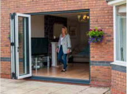
The Imagine Bi-Fold Door makes an attractive alternative to a traditional sliding patio door; completely opening your home up to the garden or patio.